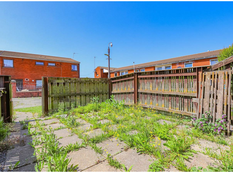
Osprey Court, Barry, CF63 4JG